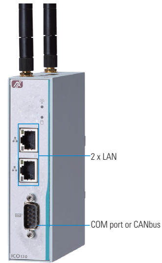
▲ Front view