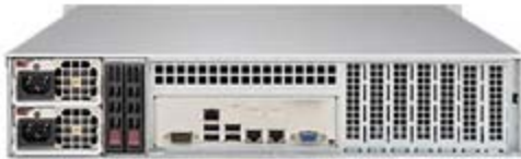
Broadcom 3008 AOC