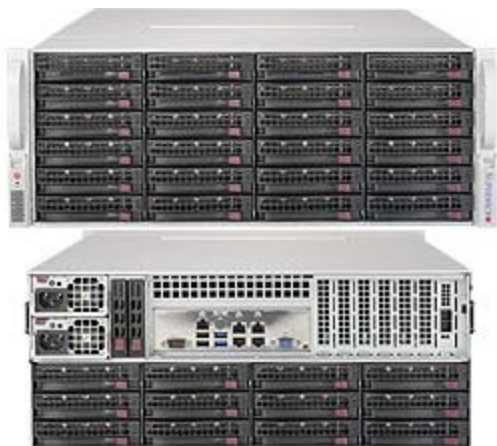
SAS3 IT controller Storage Expandable