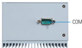
▲ Bottom view