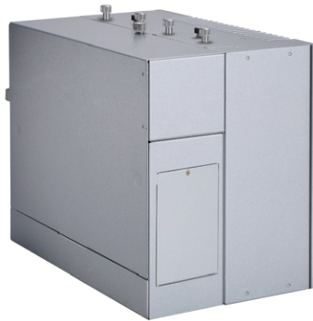
▲ Rear view