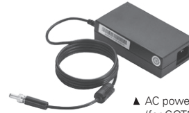
▲ AC power adapter (for GOT5840T-845-J)