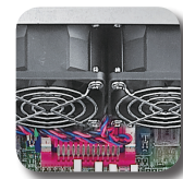
2 x rear 80mm fans(option)