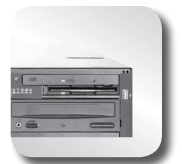
1 x 3.5" bay for FDD, slim ODD + slim FDD or storage kits