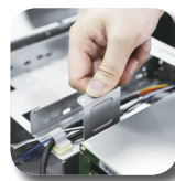
Quick latch for 5.25" ODD