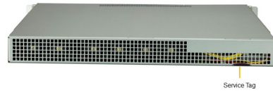
(Rear View – System)