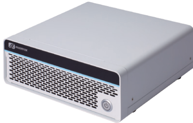
▲ Front view

Medical Grade System with 9th/8th Gen Intel® Core™ i7/i5 Processor for Smart Healthcare Applications