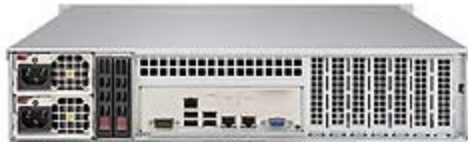
SAS3 HW RAID controller