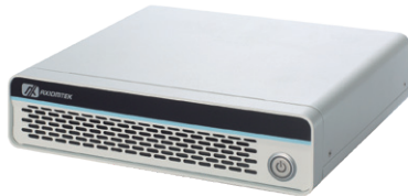
▲ Front view

Medical Grade Fanless Slim System with 8th Gen Intel® Core™ i7/i5 Processor for Smart Healthcare Applications