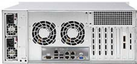
SAS3 IT mode Controller Storage Expandable