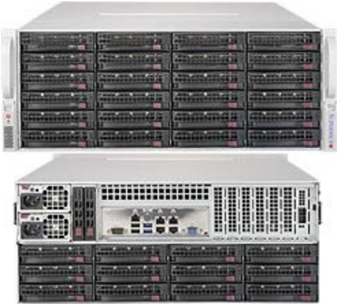
HW SAS3 Controller Storage Expandable