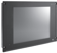
▲ Touch without keypad version