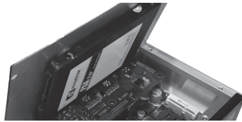
Easy storage maintenance