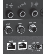
Optional I/O ports for audio, LAN jack type and DC-in jack type