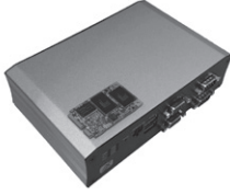
Slim and compact size 163.8 x 108 x 44 mm