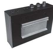
DIN rail, wall mount supported for various applications, without space limitation