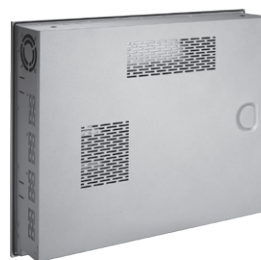
▲ Less screw design