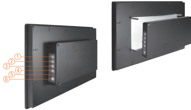
▲ Modularized design