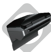
Smart Card Reader(CAC) + GPS