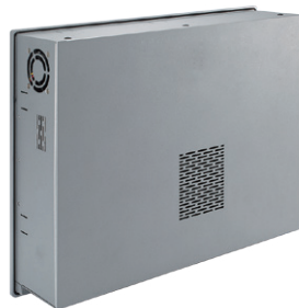
▲ Back view