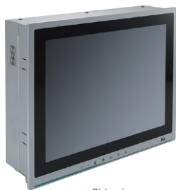
▲ Side view