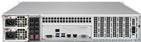
3 Broadcom 3008 AOC