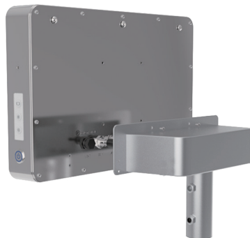
882B818A0A0E GOT818A CID2 I/O Cover Kit (Down)