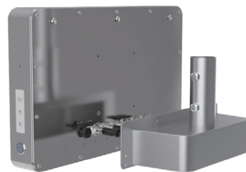
882B818A1A0E GOT818A CID2 I/O Cover Kit (Up)