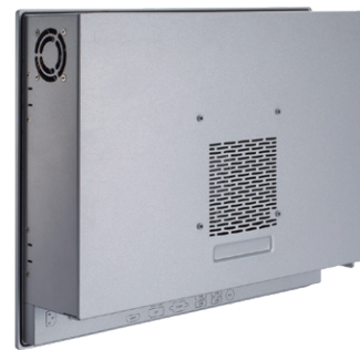
▲ Back view