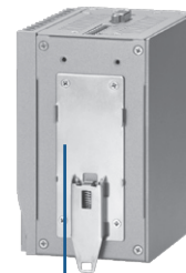
Din-rail kit ▲ Rear view