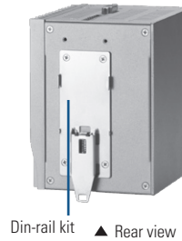
Din-rail kit ▲ Rear view